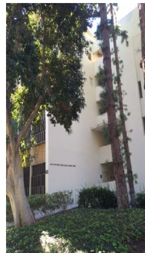
Luskin Public Affairs building side door