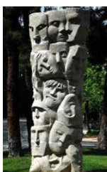
Tower of Masks sculpture